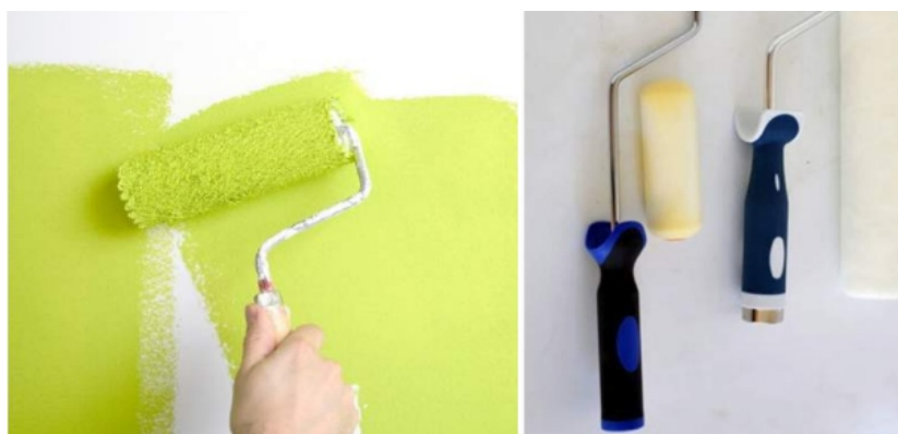
Roller application and anatomy of a roller