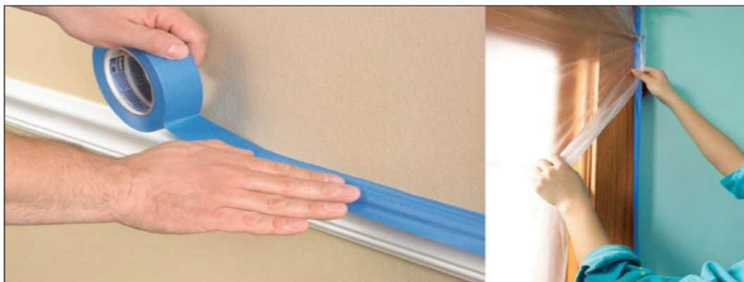
Masking with tape (vancouver.sun.com and listinspired.com)