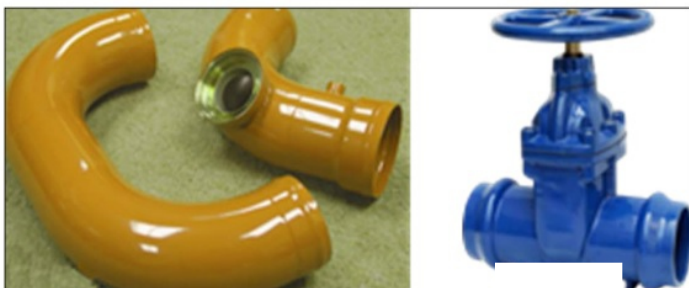
Pure Epoxy (PE) usage on coated pipes and valves