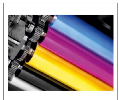
Nylon coated printing machine rollers