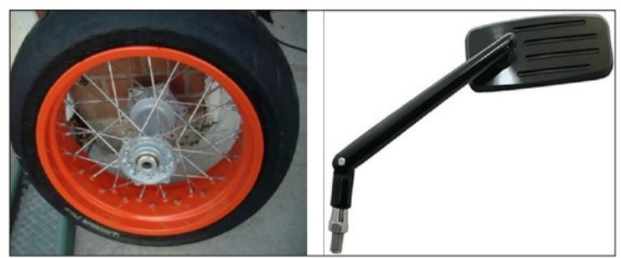
Pure Polyester (PP) usage on wheel rims and stand of a car's