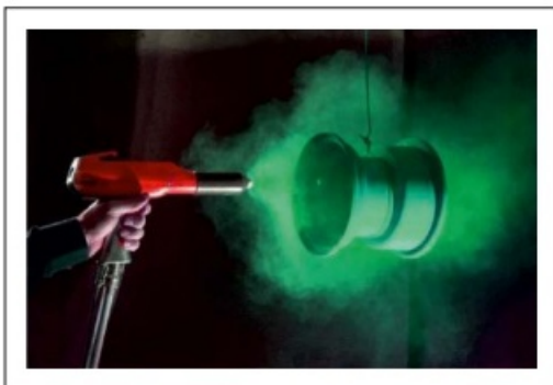
Powder coating in progress