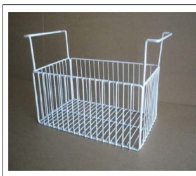
PVC coated basket for deep freezer