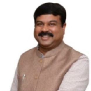
Shri Dharmendra Pradhan Cabinet Minister, Ministry of Skill Development and Entrepreneurship; Ministry of Education