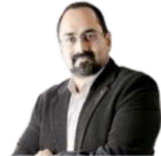
Shri Rajeev Chandrasekhar Minister of State (MoS), Ministry of Skill Development and Entrepreneurship; Ministry of Electronics and Information Technology