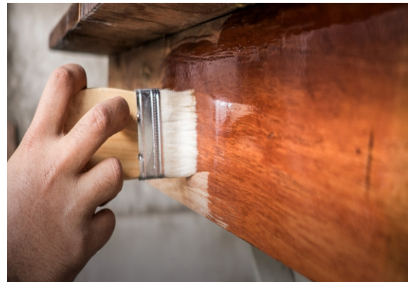
Sanding and Wood Polishing