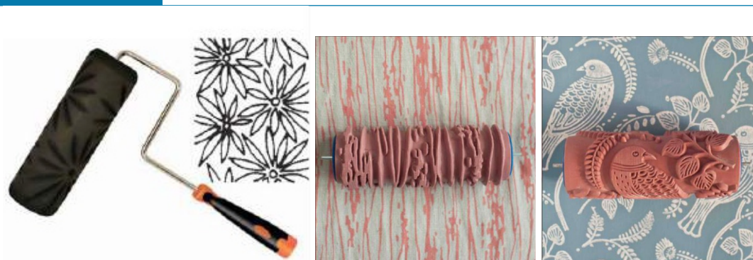
Rollers with patterns