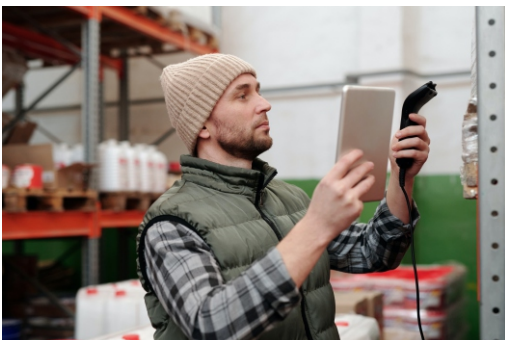
Supply Chain Supervisor