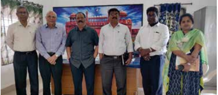
Team PCSC visited ITI Tirupathi to implement a training programme under DDU GKY scheme facilitated by SEEDAP.