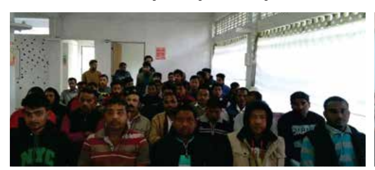
Candidates assembled for the Selection Committee Meeting in Jorhat, Assam for National Backward Class Finance Development Corporation (NBCFDC) funded training programme.