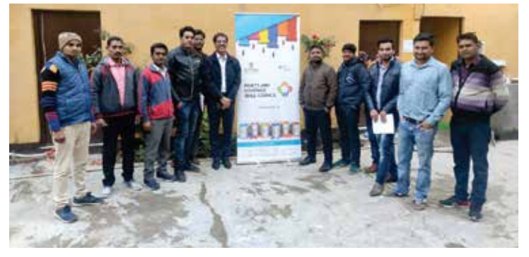
ToT in Patna