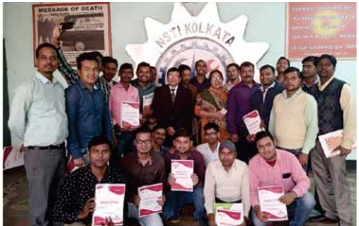
Platform Skills – ToT in Kolkatta NSTI