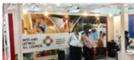
Participation in Surface and Coatings Expo 2018 by CII Southern Region