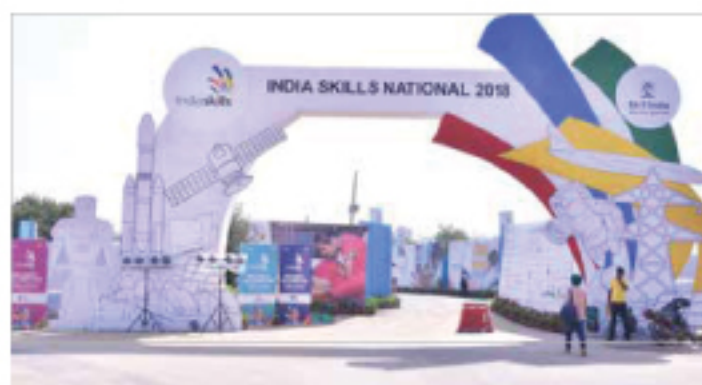
Entrance to India Skills National, 2018