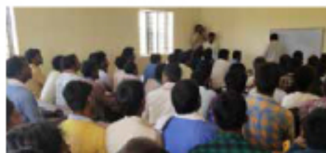
RPL for NSCFDC in progress in Rohtas Bihar