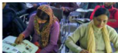
ToT in progress in Delhi for Asst Decorative Painter