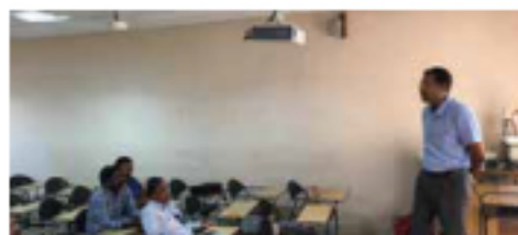
ToT on Protective and Marine Painter in NSTI

The Indian Small Scale Paint Association (ISSPA) hosted its Annual Convention in Hyderabad on 28th December 2018. With more than 2000 members, ISSPA is a key constituent of the Paints and Coatings Skill Council.