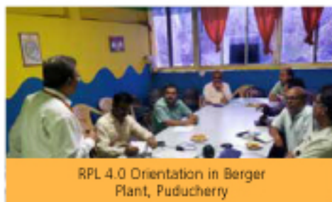
RPL 4.0 Orientation in Berger Plant, Puducherry