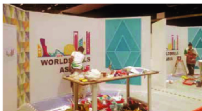
Artisans competing in World Skills Asia