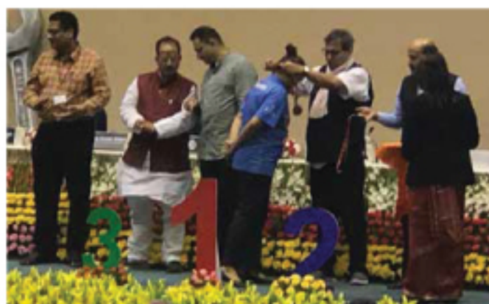
Film Director Mr Subash Ghai honouring the winners

In India, we have state wise skill competitions across several skills with Painting and Decorating being one of them. The state level winners compete in a regional competition and the regional winners compete in a national level competition. The winner and runner up of the national level competition are given rigorous training and made to compete in three mock competitions. The overall winner of these three mock competitions goes on to represent India in their respective skills in the World Skill Competition.