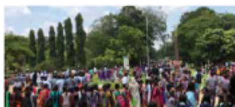
Participation in the Open Day at Central Electro Chemical Institute CECRI