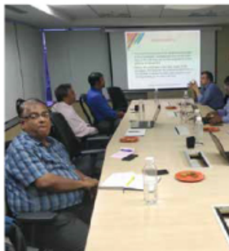
RPL 4.0 orientation programme in Nippon Paint Chennai