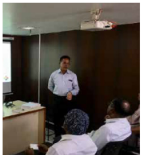
RM South made a presentation to the committee of Karnataka Powder Coaters Association