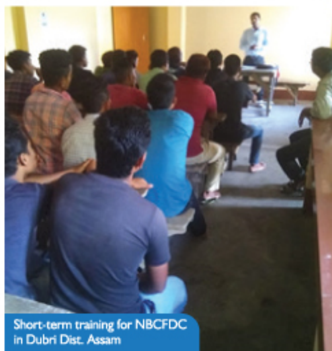
Short-term training for NBCFDC in Dubri Dist. Assam