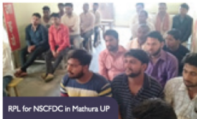
RPL for NSCFDC in Mathura UP