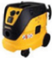
Mirka DE 1230 LAFC