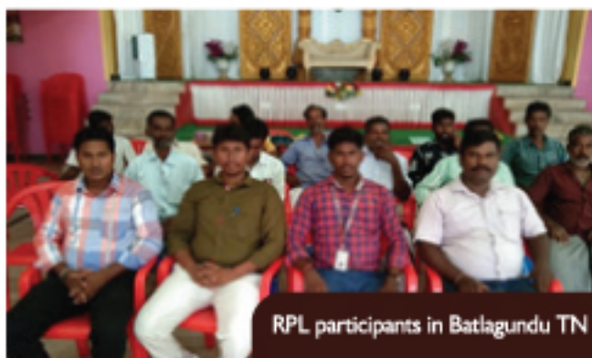
RPL participants in Batlagundu TN