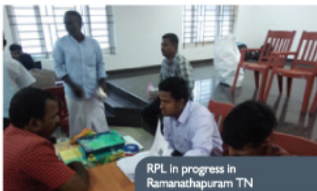
RPL in progress in Ramanathapuram TN