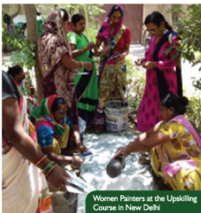
Women Painters at the Upskilling Course In New Delhi