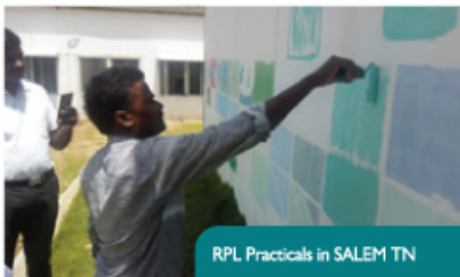
RPL Practicals in SALEM TN