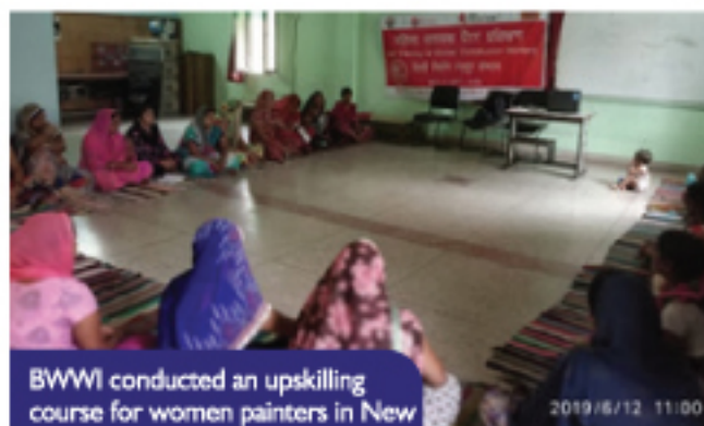
BWWI conducted an upskilling course for women painters in New Delhi