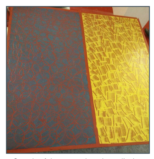
Sample of the texture boards on display