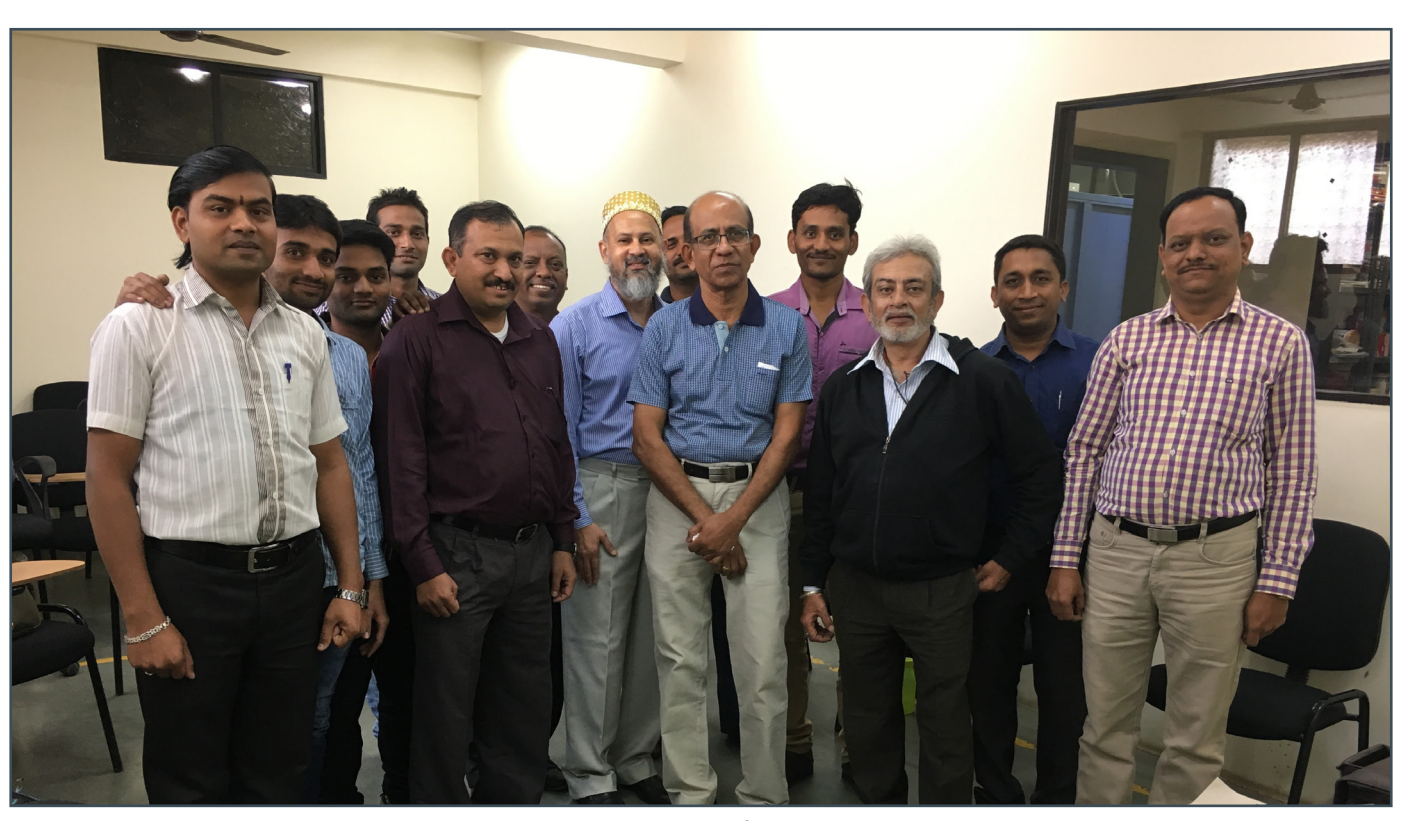
Group picture at Berger training facility at Phursungi, Pune