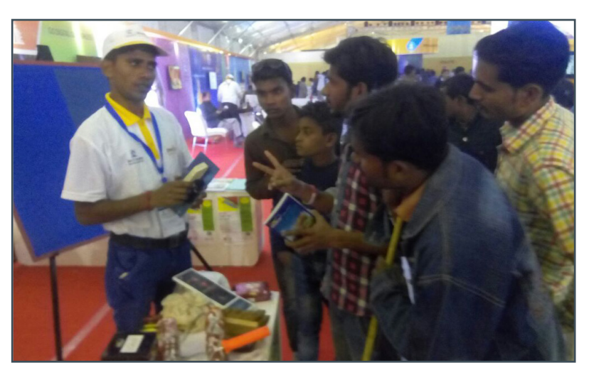
Aspirants inquiring about future prospects at the PCSC stall