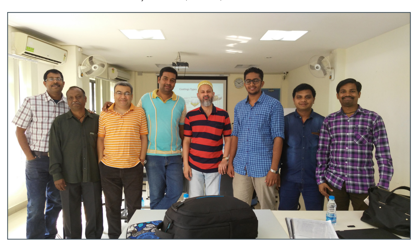
Group picture at Blastline Institute of Surface Preparation, Kochi

Field visit was conducted at The Jolly Industries, Avanoor, Trissur.